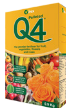
Vitax Q4 Plus