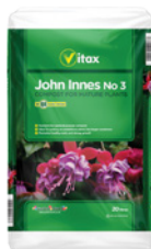
John Innes No. 3 Compost