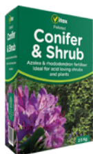
Conifer & Shrub Fertiliser