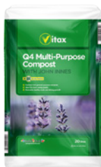
Q4 Multipurpose Compost